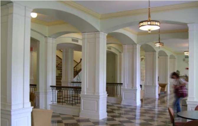
Stoddard Hall, TWU Campus