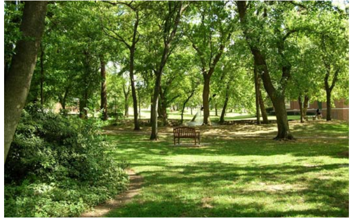
TWU Denton Campus