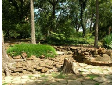
TWU Denton Campus