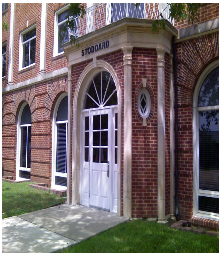
Stoddard Hall, Home of SLIS Offices