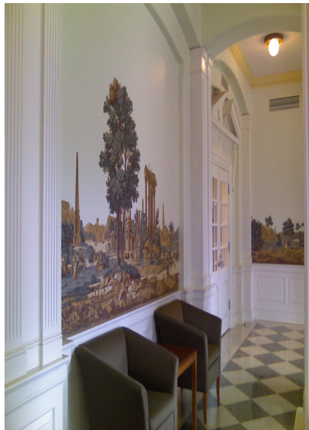
Photo from Stoddard Hall lobby