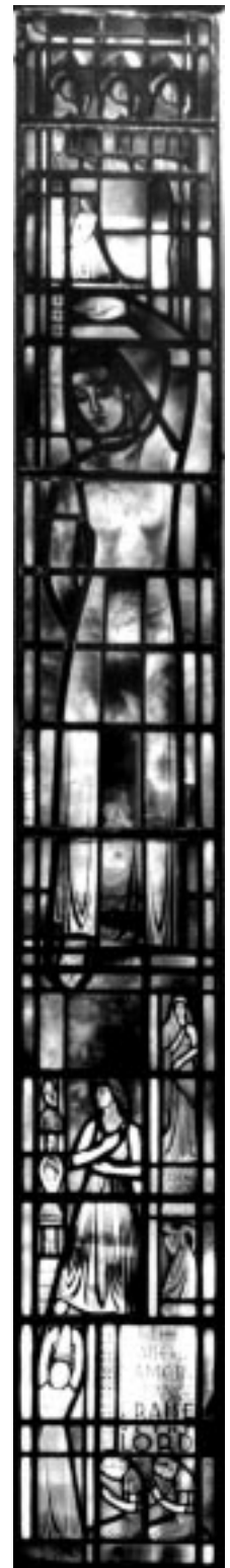
The Dance Window

TWU Office of Conference Services, P.O. Box 425379 Denton, Texas 76204 940-898-3644