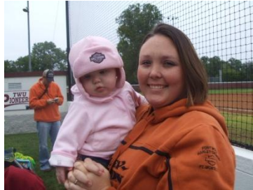
A future Pioneer?