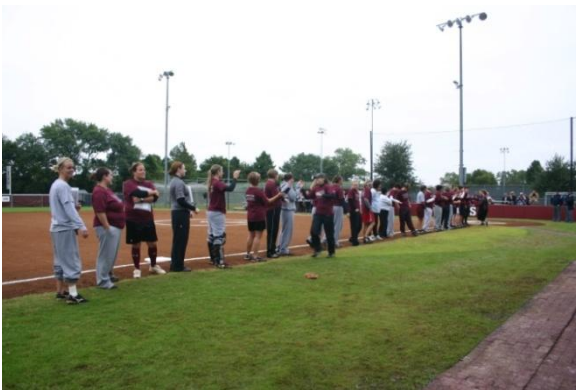
The Alumni Team is introduced to the crowd