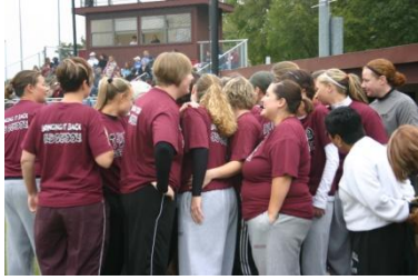
The Alumni Team gets ready to take the field