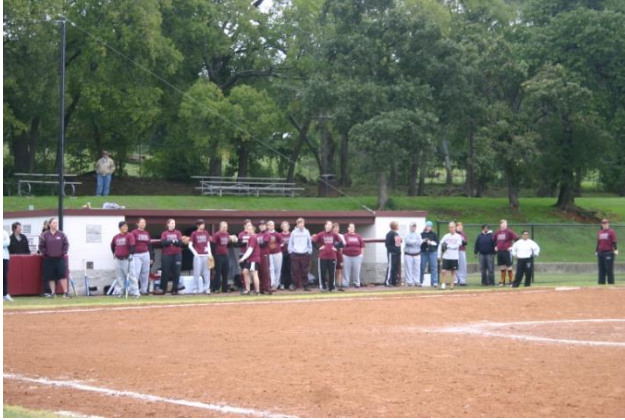
The Alumni Team in action